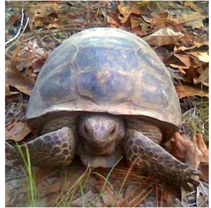
Gopher Tortoise